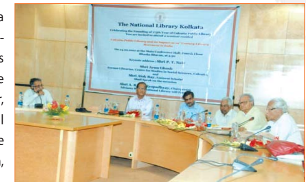
A seminar on Calcutta Public Library on 24.2.12