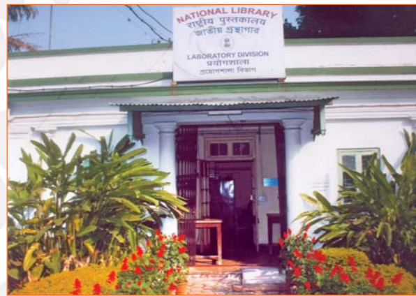
Laboratory Division, The National Library

On 11 January 2012 the seventh meeting of the Advisory Board was held at the Conference Hall. Indian Library Review , a blog hosted by the National Library, was inaugurated at the meeting. Advance copies of Nameless Recognition: Rabindranath Tagore and Other Indian Literatures were distributed to Board members.